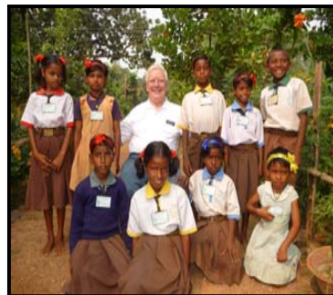
Scholarship Students-Nov. 2011