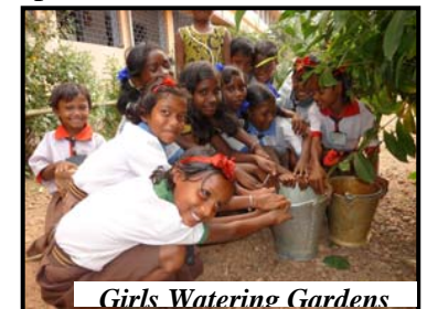
Girls Watering Gardens

most children are hungry, uneducated, and lack the basic necessities, the Loyola School Rerua offers a place of hope - where there is enough to eat, a place to sleep, and a place to learn. The school was officially established on June 10, 2005, one short year after the Rerua Mission was founded. The elementary school started with just 13 children and has grown to over 400 students. Middle and high school students attend Chaira School